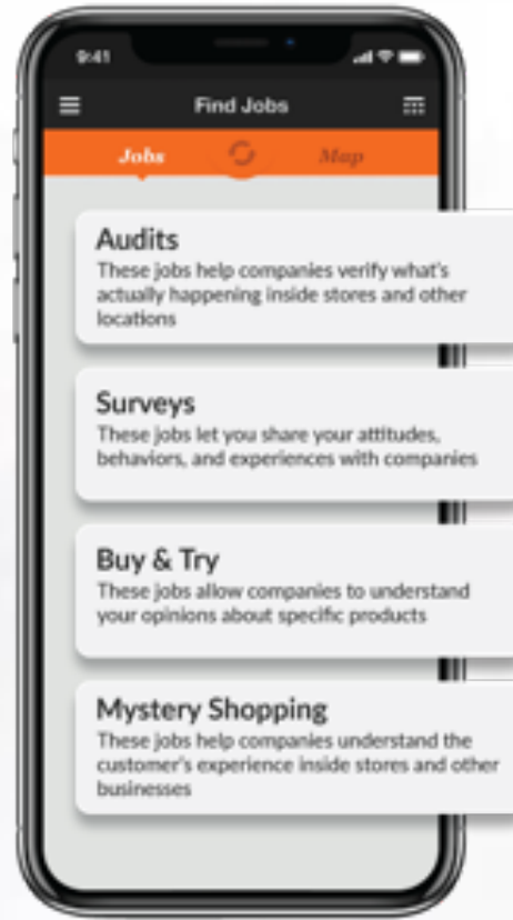
Reserve & Complete